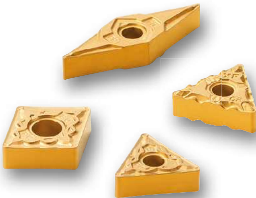
Cermet application map

Wide range of cutting speeds from general to high speed provides long tool life in finishing applications